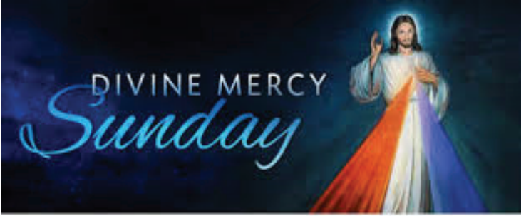
*Humanity will not find peace until it turns trustfully to divine mercy.* St. Faustina's Diary, p. 132

What are the graces and benefits that our Lord wants to spread out before us on Mercy Sunday? Jesus said to St. Faustina ( Diary , 699):